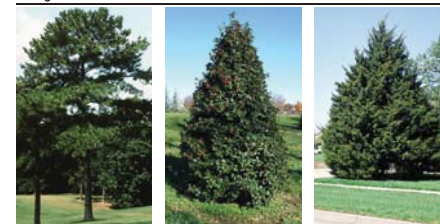
5 Loblolly Pine 6 American Holly 7 Eastern Red Cedar