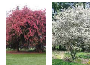
3 Green Hawthorn 4 Downy Serviceberry