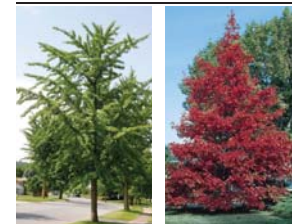
1 Ginkgo 2 Northern Red Oak