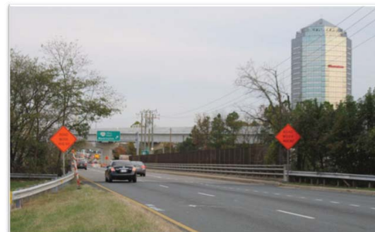
Leesburg Pike (Route 7) looking toward Tysons Corner.

Purpose – Increase capacity, safety and mobility.