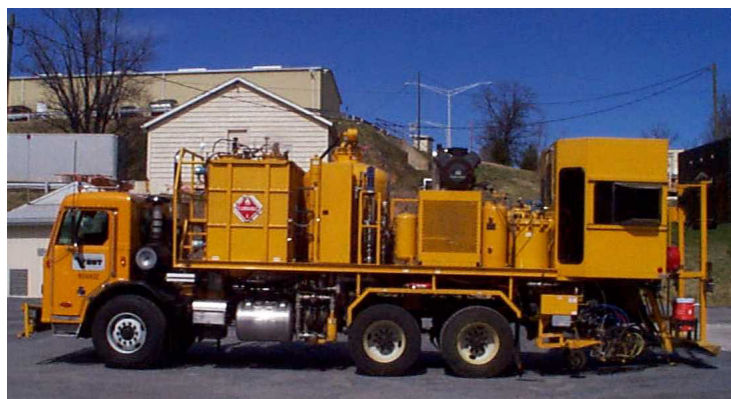
Figure 11.1 A typical long-line application truck

Long-liners, as the name implies, are designed to produce long distance pavement markings. They are self-propelled and are equipped to carry relatively large quantities of material. Most are set up with more than one applicator or spray gun. Figure 11.1 shows a typical long liner. Hand-liners, which are much smaller than long-liners, are generally designed for operators to walk behind. They can only carry a limited quantity of material. The need for walk-behind applicators may be stated in the contract documents. Figure 11.2 illustrates a typical walk-behind applicator.