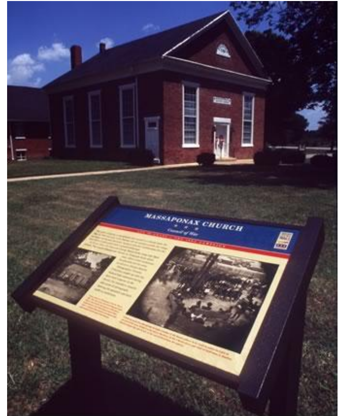
Virginia Civil War Trails interpretation at Massaponax Church near Spotsylvania