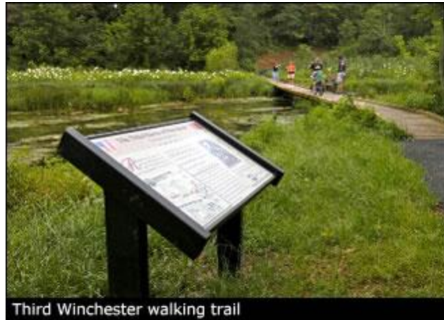
Third Winchester walking trail