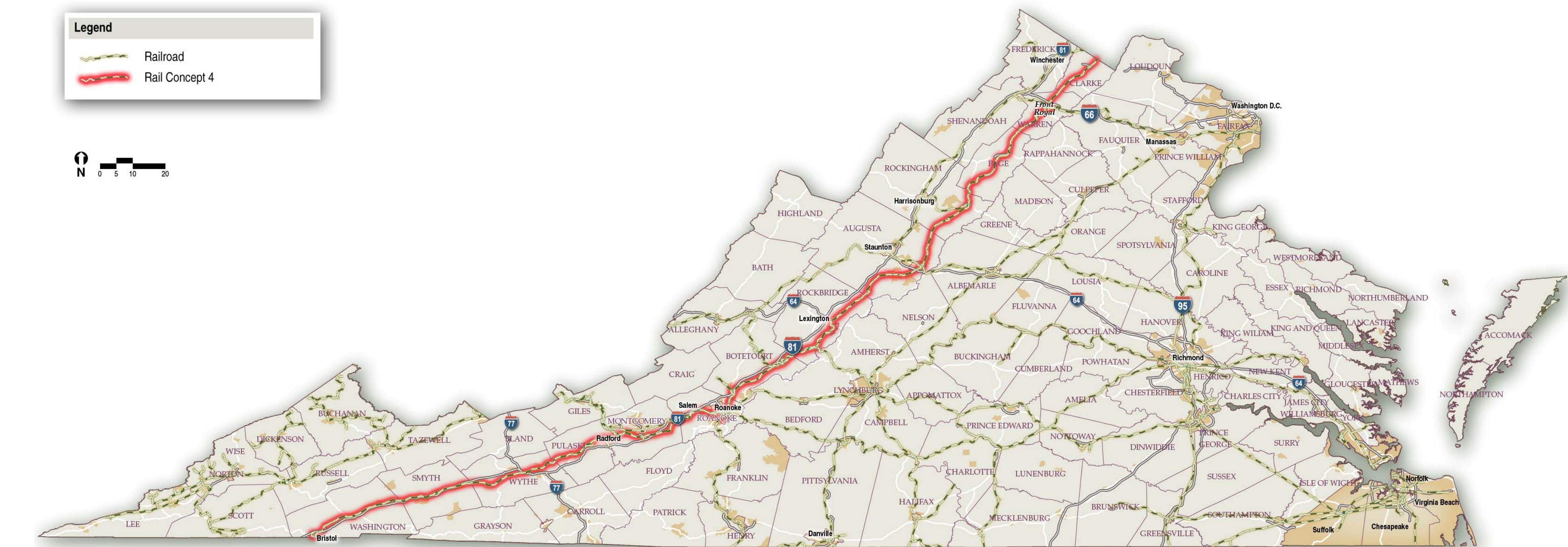
Rail Concept 4