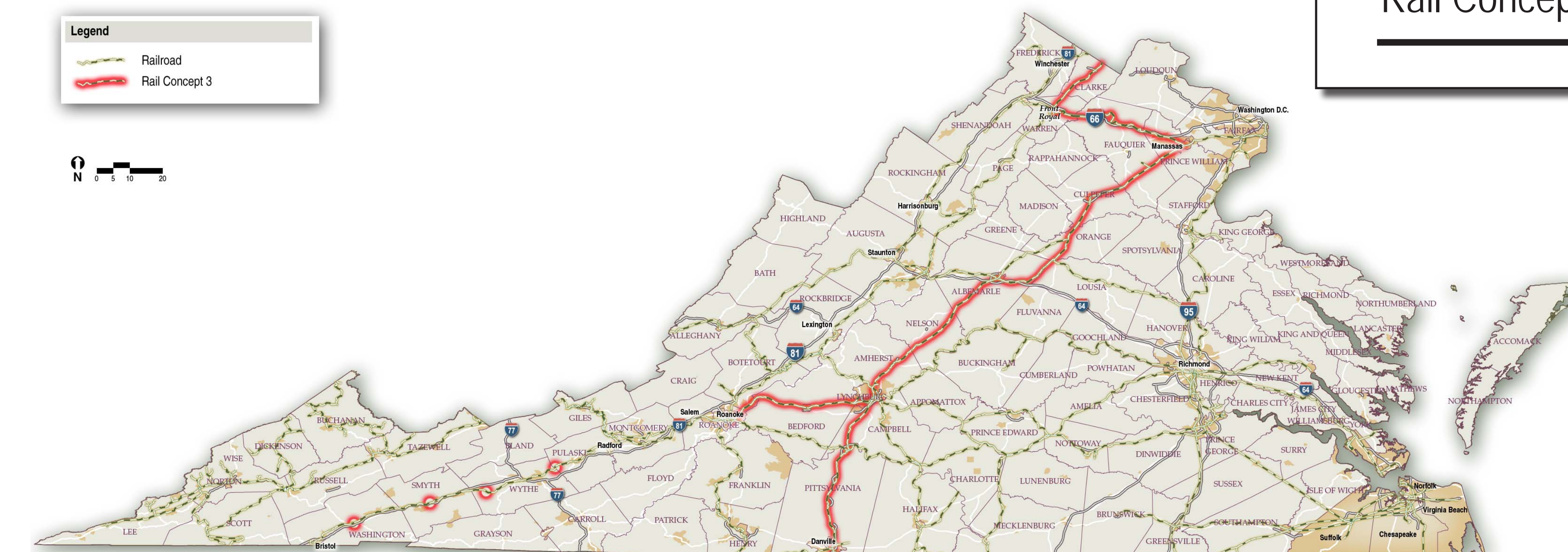
Rail Concept 3