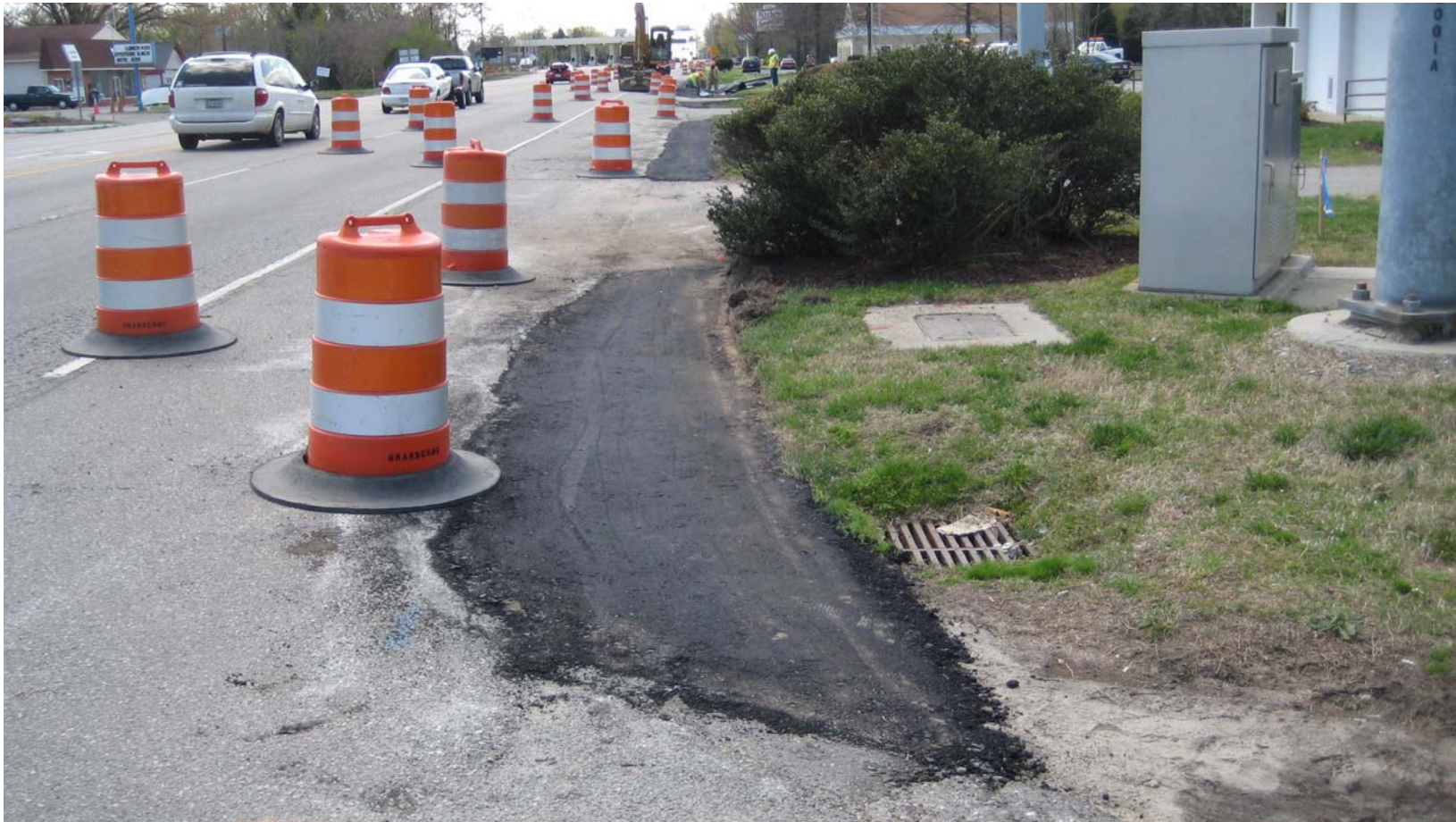
Shoulder Widening Southbound Lane