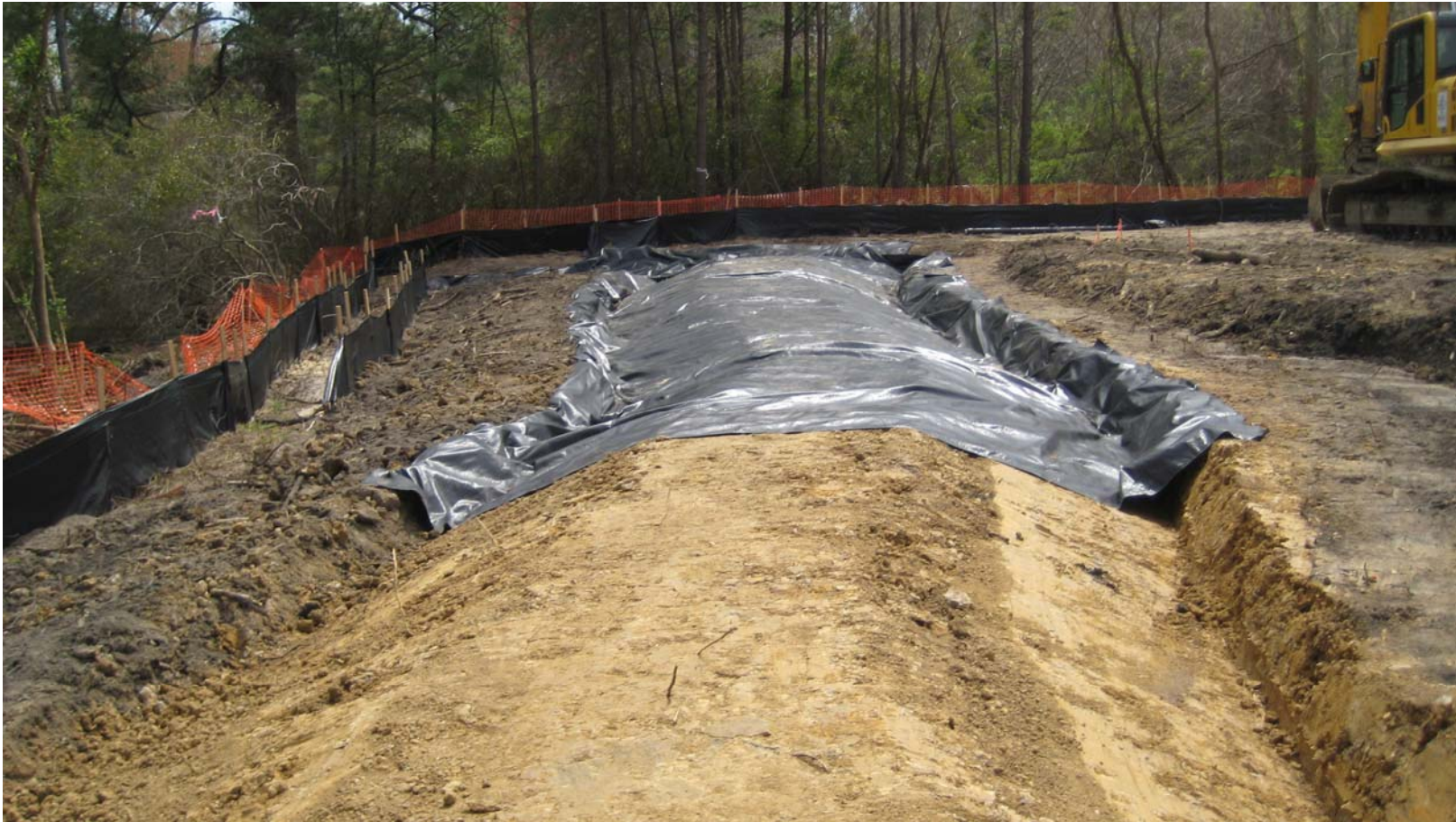
Stormwater Management Pond