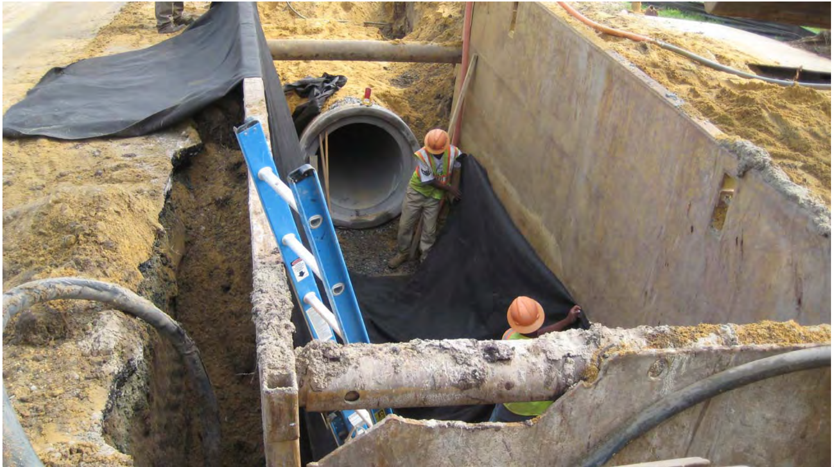
Storm Sewer Installation