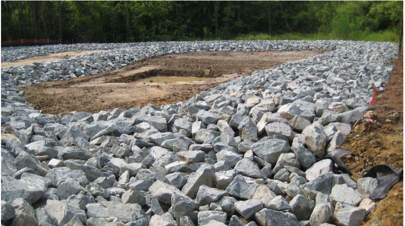
Stormwater Management Pond