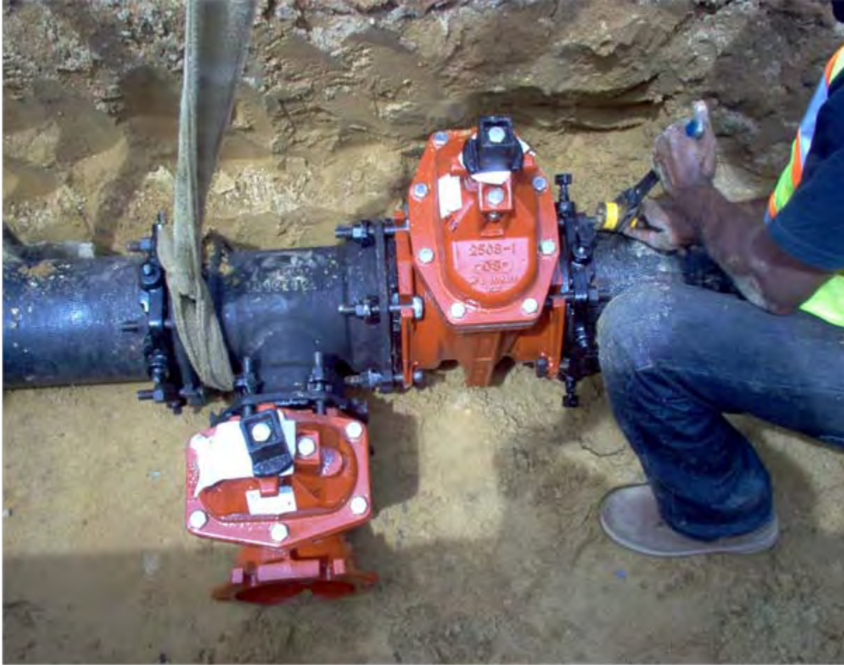
New Waterline Valves