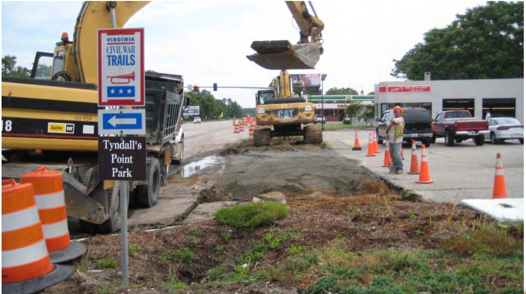
Demolition of Entrances