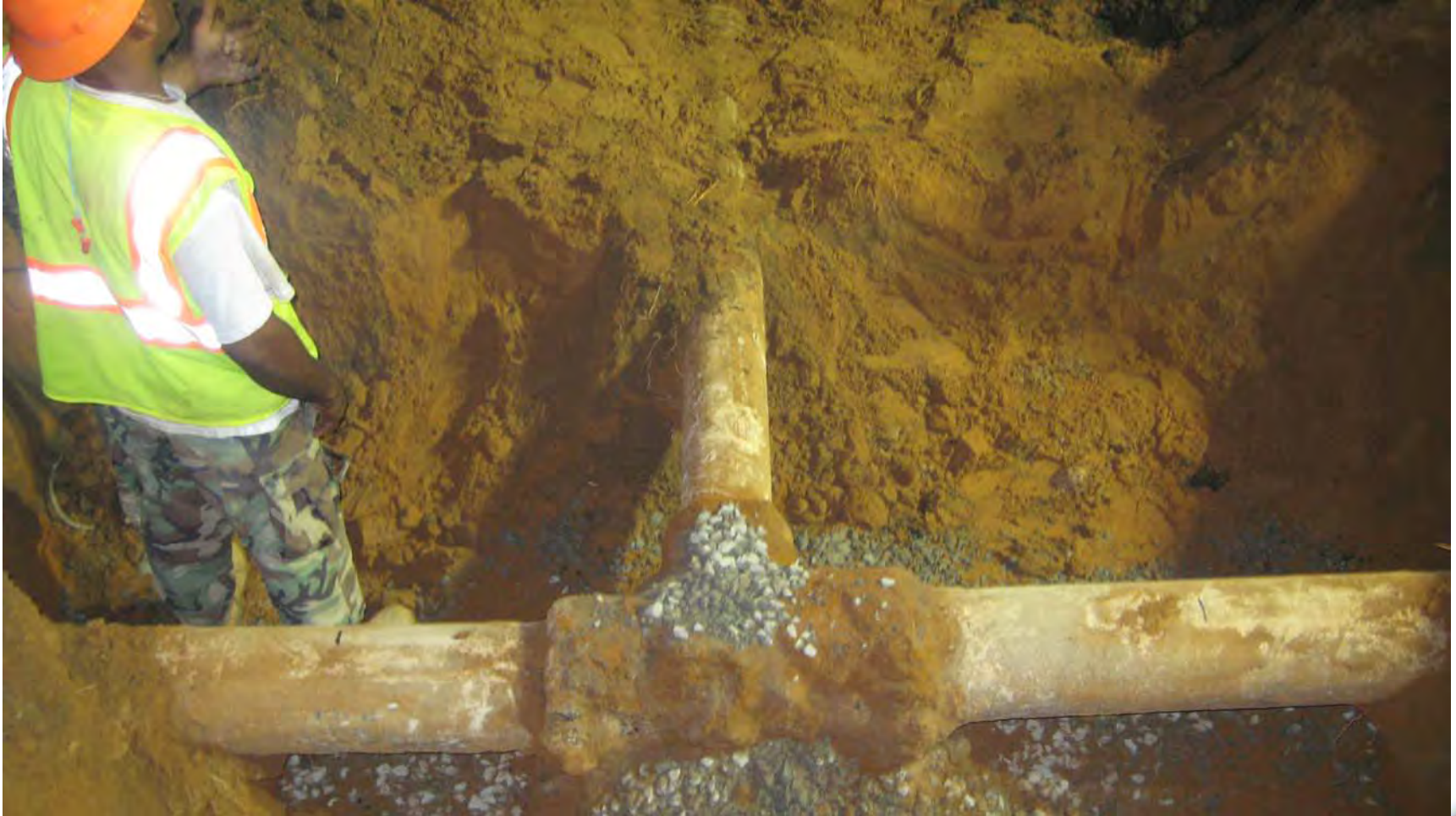
Old Asbestos Waterline