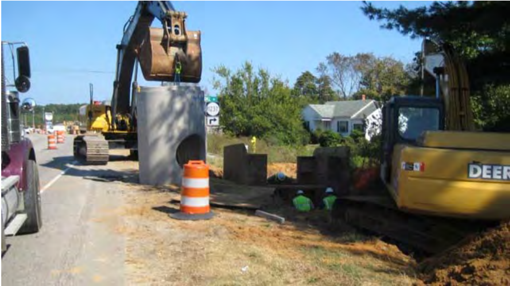
Precast Drop Inlet