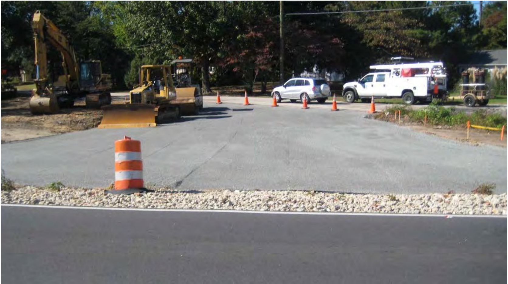
Camp Okee Drive Realignment