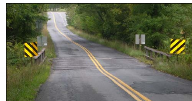
Gleedsville Road Bridge over Sycolin Creek