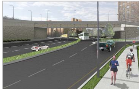
Westbound Rt. 50 at Courthouse Rd.