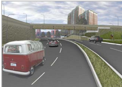
Westbound Rt. 50 at 10th St.