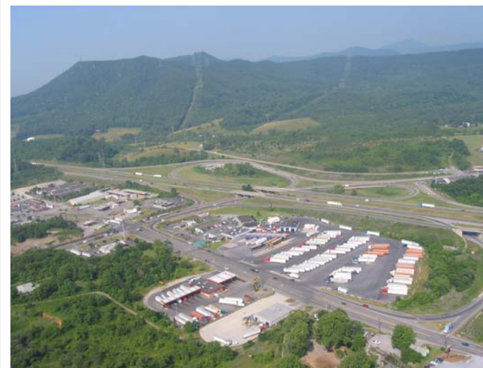
Aerial view of Route 11 north of Route 220 and Route 220A

Cost – Approximately $41 million Purpose – To improve safety and capacity of the existing Route 11/220/220A intersection in conjunction with the interchange. From – 0.15 mile north of Route 1039 on Route 220 Alternate (at Norfolk Southern railroad) To – 0.50 mile south of Route 653 on Route 220 Total length – 1.65 miles Improvements – Increase safety and capacity using new design improvements and access management