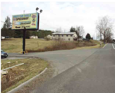
Field photo of existing intersection of Speedway Entrance and Route 11. View of photo is to the east from roadside edge of pavement.