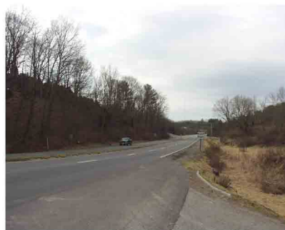
Field photo of existing intersection of Speedway Entrance and Route 11. View of photo is to the west from the center of the Speedway Entrance exit lane.