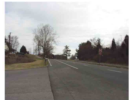
Field photo of existing intersection of Speedway Entrance and Route 11. View of photo is to the east from the center of the Speedway Entrance exit lane.