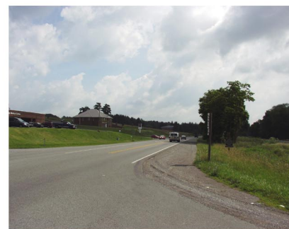
Field photo of existing intersection of Cemetery Road and Route 11. View of photo is to the east from the center of Ruebush Road exit lane.