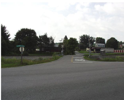
Field photo of existing intersection of Cemetery Road and Route 11. View of photo is from the north side of Route 11 edge-of-pavement.

Map produced by the NRVPCD using VGIN data. June, 2009