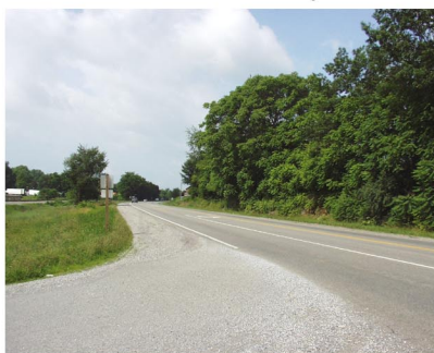
Field photo of existing intersection of Cemetery Road and Route 11. View of photo is to the west from the center of Ruebush Road exit lane.