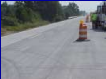
I-96, Ottawa County, 2004