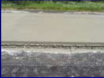
US 131, Kalamazoo County, 2004