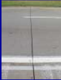
I-96, Ionia County, 1986