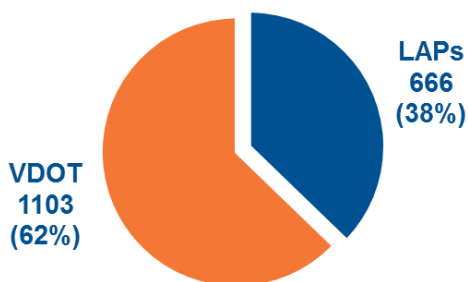
LAP Percent of CN Projects 1769 TOTAL Projects