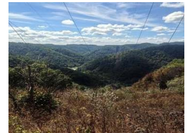
Corridor Q: Route 460/121 Poplar Creek