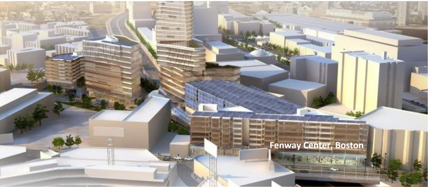
Fenway Center, Boston