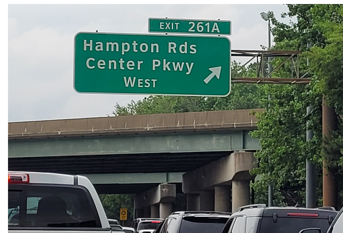
I-64 west at Hampton Roads Center Parkway