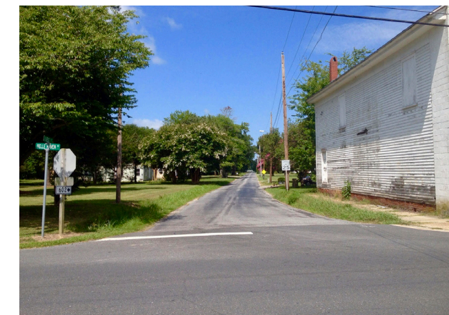
Lee Street (background) at the intersection with Belle Haven Road (foreground) in Belle Haven