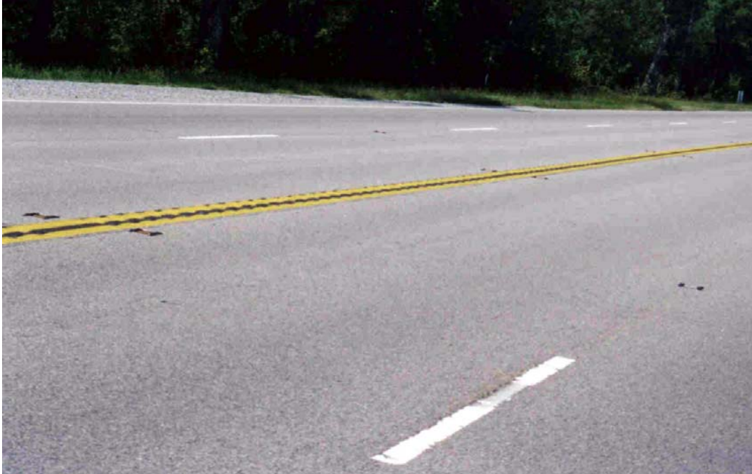
Figure 3. CLRS on Route 460 in Sussex County

Undivided highways in the primary and secondary (P&S) systems make up the majority of the miles of highways in Virginia. In 2003, undivided P&S highways totaled 53,248 miles, accounting for 74.7 percent of the total highway mileage (71,243 miles) and 95 percent of the P&S systems (55,859 miles). 5 These numbers include local roads and subdivision streets. Given the magnitude of the percentage of undivided highways in Virginia, the potential for enhancing safety by using CLRS presents a challenging opportunity for VDOT.