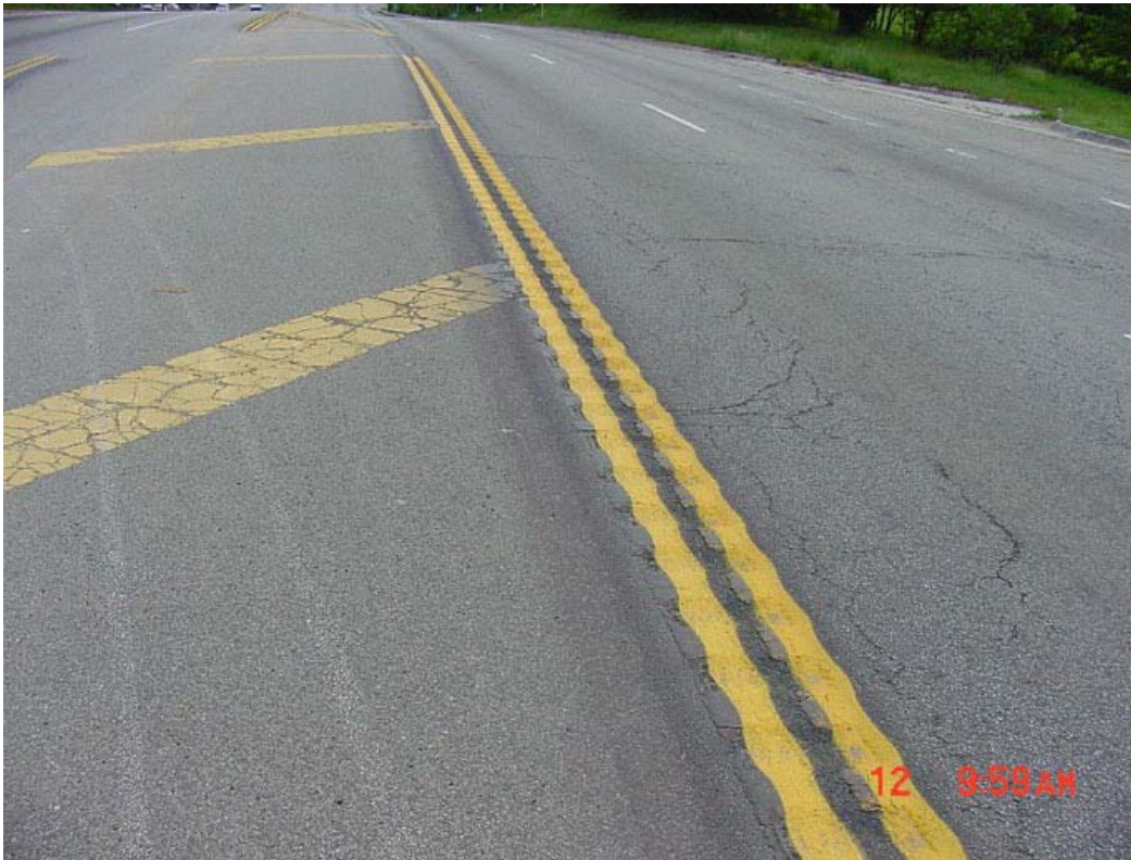
Figure 2. CLRS on Route 1 in Fairfax County