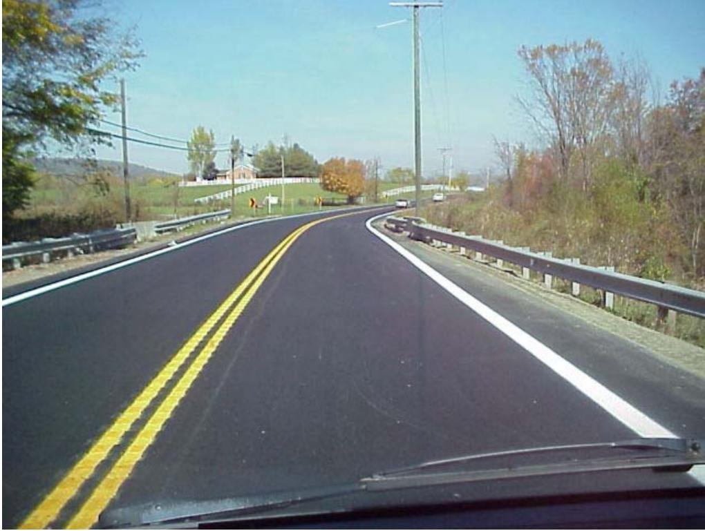
Figure 1. CLRS on Route 15 in Loudoun County